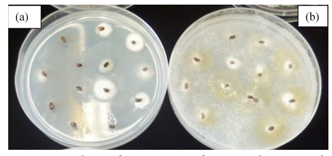
Figure 1. Incidence of contaminating fungi in yerba mate seeds with asepsis (a) and without asepsis (b).

BDA plaques can be explained by the high concentration of carbon available to the fungi through the starch from potatoes present in the medium. Thus, we decided to only work with disinfected seeds based on these results.