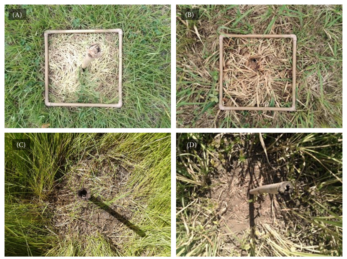
Figure 3. Senescence levels 2 (A) and 3 (C) for U. humidicola and senescence levels 2 (B) and 3 (D) for M. maximus as a result of the cardboard crowning. Photos A and B were taken 35 days after crowning, and photos C and D 120 days after crowning.

The importance of controlling grasses in reforestation projects aims to obtain greater growth and survival gains for tree species (Ammondt & Litton, 2012; Dias et al. , 2016; Mantoani & Torezan, 2016; Santos et al. , 2019). Gonçalves et al.