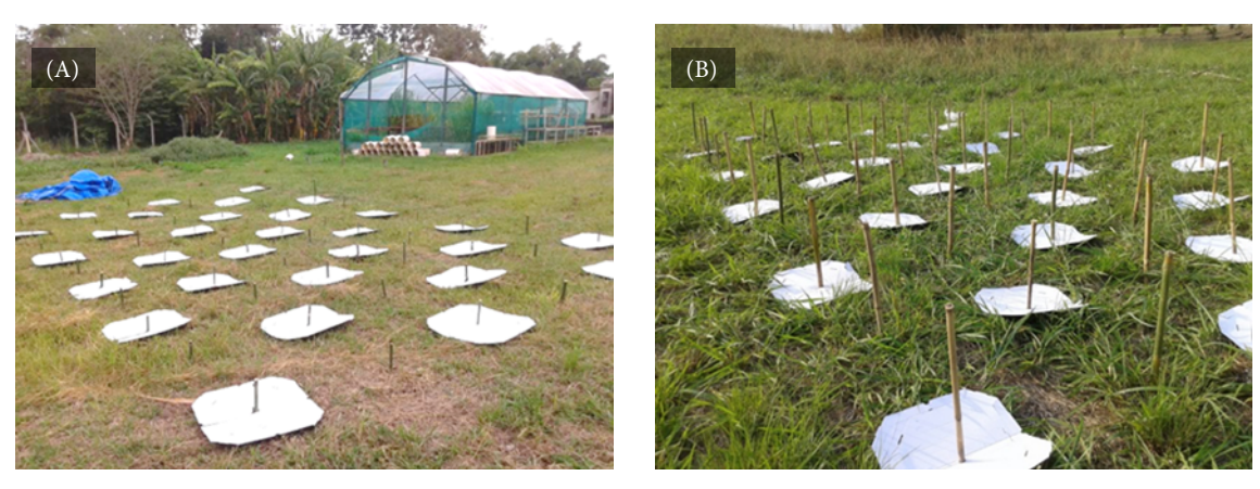
Figure 1. General views of the experimental sites with Urochloa humidicola (A) and Megathyrsus maximus (B). Bamboo poles were used to simulate seedlings in the field.

The data obtained at each site were analyzed independently. The dry biomass data were analyzed on each collection date using the t test at a 5% significance level to compare the two treatments.